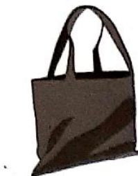
1 bag _____