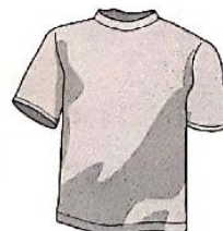
8 T-s _____