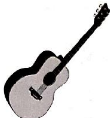
4 g _____