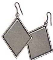
3 e _____