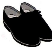
7 s _____