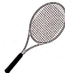
6 t _____ r _____