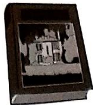
2 b _____