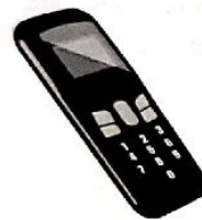
5 m _____ p _____